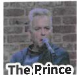
The Prince of Mystery